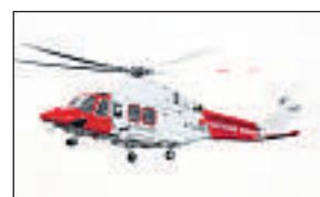
Coastguard helicopter from Lee-on-Solent