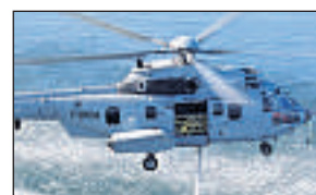
French Navy Puma from Cherbourg