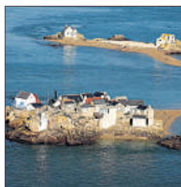
The two fishermen were found on the Ecréhous by colleagues and air-lifted to hospital by a French navy helicopter