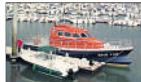
The Carteret lifeboat