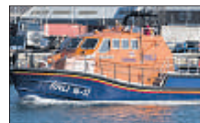
The St Helier all-weather lifeboat