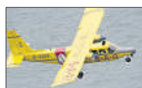
Channel Islands Air Search aircraft Lions' Pride, before it was forced to crash-land