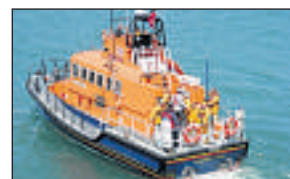
The Alderney lifeboat